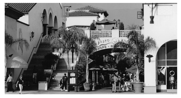
Paseo-Nuevo, the newest paseo in Santa Barbara, is an active pedestrian mall with many shops and restaurants.